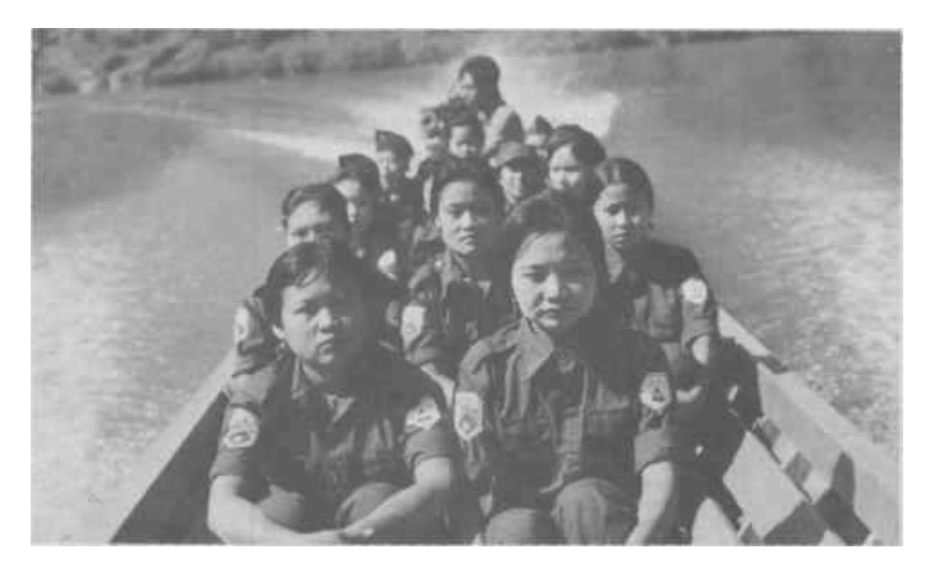
Women signal and medical trainees out to the front.

A shell game was played globally. The concept of a people and a nation was fast-switched with that of an ethnic group and a state. Peoples were recategorized as ethnic groups, and ethnic groups were recast as peoples. For example, the autonomous Karens and their nation were termed a Burmese "hill tribe," whereas the Burman people - only one of a dozen nations in British-created Burma - became the ruling regime of the mythical "Burmese people." Despite the fact that no nation people has voluntarily given up its national identity and national territory, state governments, interstate agencies and state universities and newspapers carry on as if the existence of the state automatically erases the existence of nations.