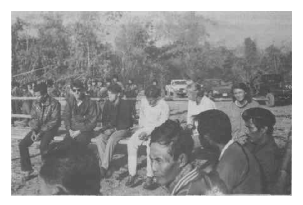
Foreign Journalists at Payathonzu Karen New Year Day.

The enemy had arrange a meeting at Nam Pot with entertainments, but because they were smashed at their encounter with the KIA, their plan did not materialise. More over the KIA shelled Nam Pot with 75 mm recoiless Rifle, inflicting (7) enemy officers and many villagers wounded. The enemy with their guests boarded (4) Helicopters and flew home.