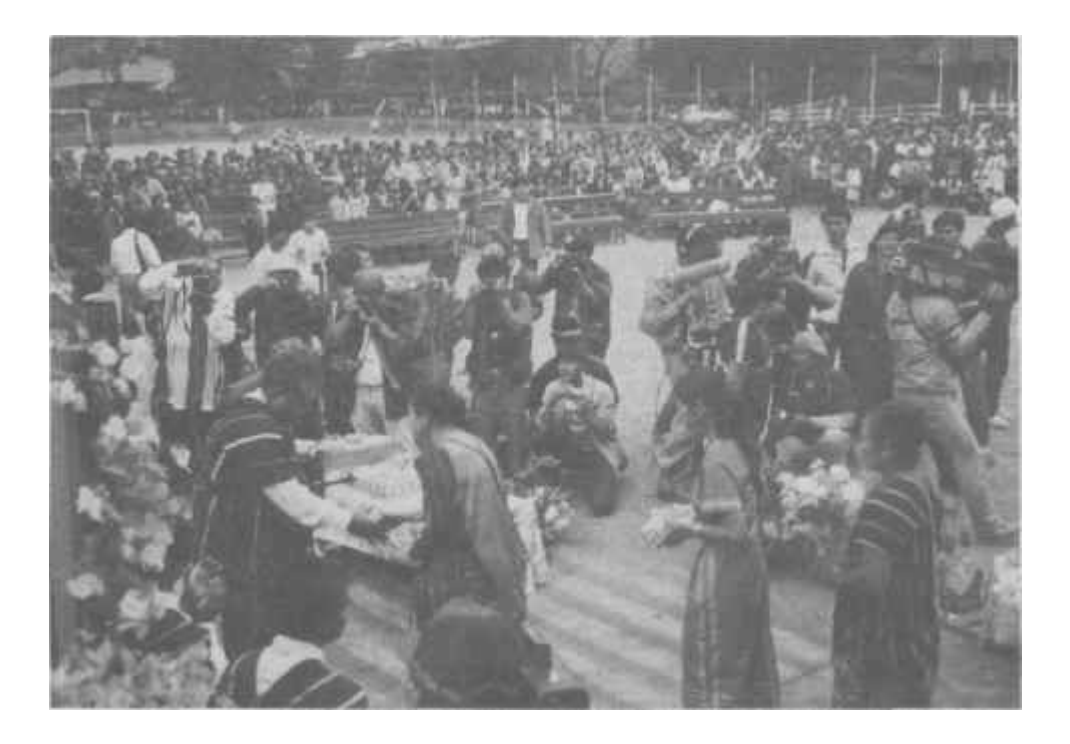
Presentation to Gen. Bo Mya on his 61st Birthday.

In September 1987 armed men acting on orders from the National Security Council in Bangkok, forcibly removed about 160 families from 4 villages on the Thai*Burma border and deposited them on Burmese soil. They were forced onto trucks at short notice, allowed few possessions and their houses were set on fire. The people, from the Ahka and Lisu tribes, depend on their crops, which were left in the fields. The official view that these nomadic people are illegal immigrants is open to dispute.