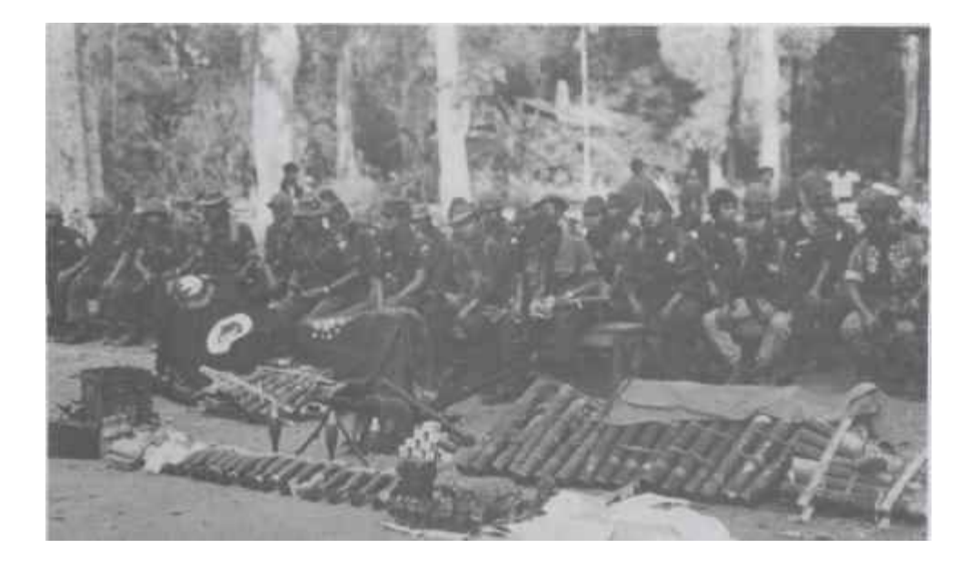
Arms and Ammos Captured by KNLA at Ker Gaw battle