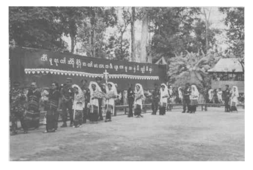
Mass Wedding of (43) couples at Kawmoora 5.12.87