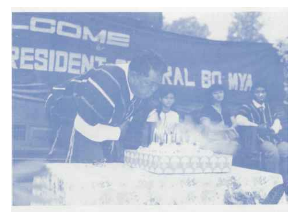
Gen. Bo Mya blowing out the 61 candles.